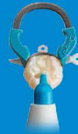
Neo Spectra™ ST Universal Composite Restorative