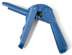
Compule/Compula Tip Gun 60665900

For easy handling of compule tips, i.e. direct and precise placement of the composite and compomer restorative into the cavity. Fully autoclavable.