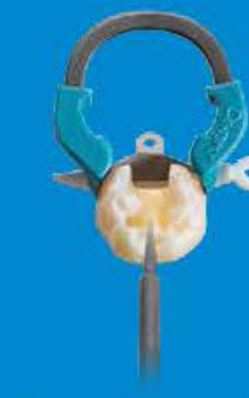
Prime&Bond universal™ Universal Adhesive