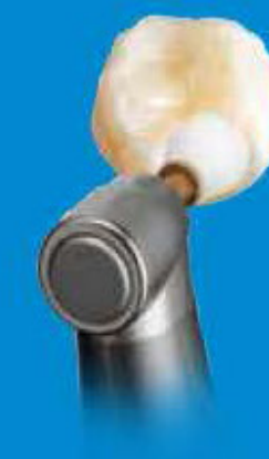
Enhance® Finishing System