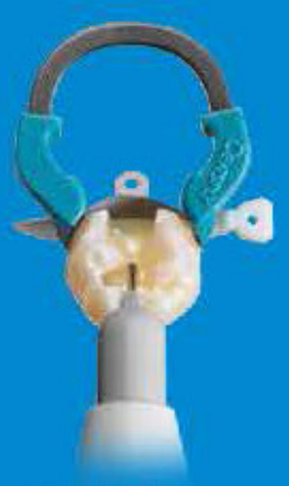
SDR® Plus Bulk Fill Flowable