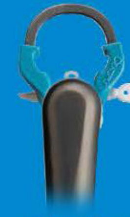
SmartLite® Pro Modular LED Curing Light